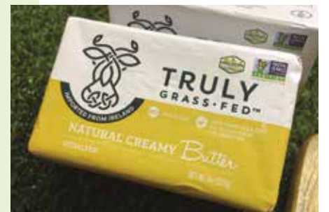
The Truly Grassfed brand is now available in over 2,000 stores across North America

Glanbia Ireland brings Certified Animal Welfare Approved by AGW cheeses and butters marketed under the Truly Grassfed label to the North American marketplace. Certified Animal Welfare Approved by AGW cheeses and butters from the Glanbia Cooperative is now available in over 2,000 stores across the U.S. and Canada!