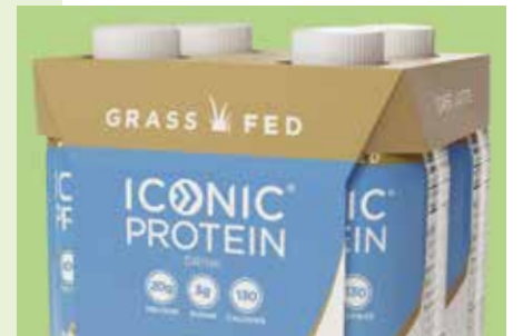
ICONIC Protein powders and drinks are available at leading retail stores in the U.S.

ICONIC Protein is the first beverage company to source Certified Animal Welfare Approved by AGW dairy products for their line of protein powders and drinks. Available in a variety of nature-inspired flavors, Certified Animal Welfare Approved by AGW ICONIC Protein powders and drinks are available at leading retail stores across the U.S.