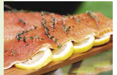
A world first: Superior Fresh Salmon is Certified Non-GMO by AGW

On salmon, the Certified Non-GMO by AGW label includes A Greener World's Salmon Welfare Certified standards, incorporating the UK RSPCA's respected higher welfare salmon standards.