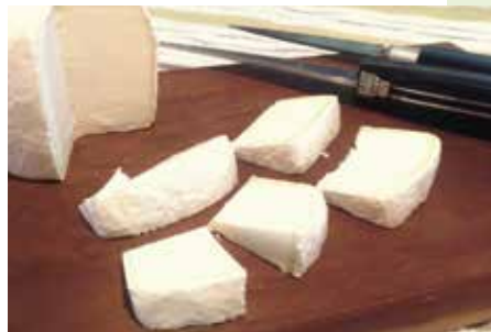
Ruggles Hill Creamery took home four awards at the American Cheese Society Competition