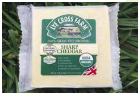
Lye Cross Farm's Sharp Cheddar won Bronze at the World Cheese Awards 2019