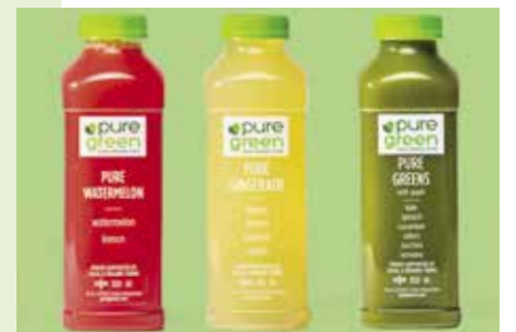
Pure Green: the first juice company to source Certified Non-GMO by AGW ingredients

Pure Green is the first juice company to source Certified Non-GMO by AGW ingredients for their growing line of cold pressed juices. The fast-growing franchise and wholesale business sells cold pressed Certified Non-GMO by AGW Pure Green juice drinks at its locations across the country, as well as online at puregreen.com.