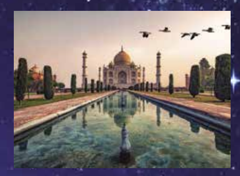
AGW launched operations in India

A Greener World launched its first operation in India in response to invitation from the region. We are looking forward to working with independent farmers and businesses to grow the market for sustainable food in India and offer farmers the opportunity to add value and get rewarded in the marketplace for their environmentally sound, higher welfare practices.