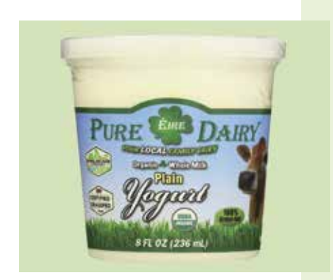
Award-winning yogurt from Pure Éire Dairy