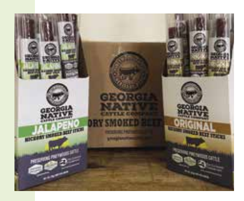
Pineywoods beef sticks from Georgia Native