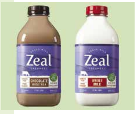
Zeal Grass Milk Creamery's milk products