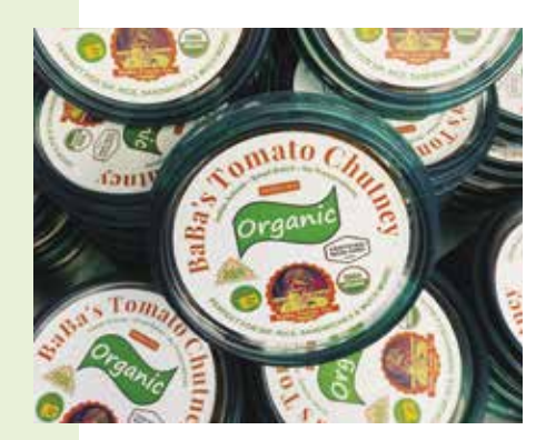
Baba Foods AGW-certified tomato chutney

Zeal Grass Milk Creamery was founded on the desire to bring milk from pasture-raised cattle to homes across the U.S. Marketed under the Zeal brand, and using milk from Free Range Dairies, LLC., Zeal's growing product line includes whole milk, chocolate whole milk, slightly salted butter and unsalted butter. Products are now available in various outlets across the country.