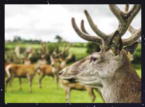
Deer at Westcountry Premium Venison