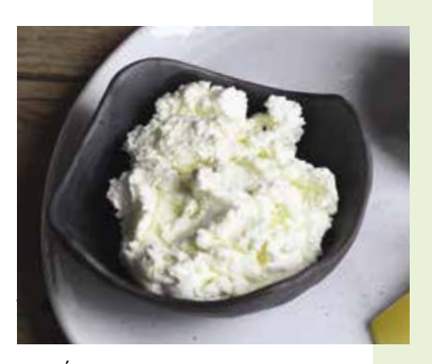
Pure Éire Dairy